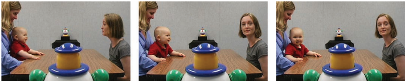
Fig. 2. Gaze following is a mechanism that brings adults and infants into perceptual contact with the same objects and events in the world, facilitating word learning and social communication. After interacting with an adult ( left ), a 12-month-old infant sees an adult look at one of two identical objects ( middle ) and immediately follows her gaze ( right ).

Shared attention. Social learning is facilitated when people share attention. Shared attention to the same object or event provides a common ground for communication and teaching. An early component of shared attention is gaze following (Fig. 2). Infants in the first half year of life look more often in the direction of an adult's head turn when peripheral targets are in the visual field (31). By 9 months of age, infants interacting with a responsive robot follow its head movements, and the timing and contingencies, not just the visual appearance of the robot, appear to be key (32). It is unclear, however, whether young infants are trying to look at what another is seeing or are simply tracking head movements. By 12 months, sensitivity to the direction and state of the eyes exists, not just sensitivity to the direction of head turning. If a person with eyes open turns to one of