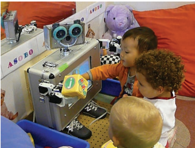
Fig. 4. A social robot can operate autonomously with children in a preschool setting. In this photo, toddlers play a game with the robot. One long-term goal is to engineer systems that test whether young children can learn a foreign language through interactions with a talking robot.

The science of learning has also affected the design of interventions with children with disabilities. Speech perception requires the ability to perceive changes in the speech signal on the time scale of milliseconds, and neural mechanisms for plasticity in the developing brain are tuned to these signals. Behavioral and brain imaging experiments suggest that children with dyslexia have difficulties processing rapid auditory signals; computer programs that train the neural systems responsible for such processing are helping children with dyslexia improve language and literacy (76). The temporal "stretching" of acoustic distinctions that these programs use is reminiscent of infant-directed speech ("motherese") spoken to infants in natural interaction (77). Children with autism spectrum disorders (ASD) have deficits in imitative learning and gaze following (78–80). This cuts them off from the rich socially mediated learning opportunities available to typically developing children, with cascading developmental effects. Young children with ASD prefer an acoustically matched nonspeech signal over motherese, and the degree of preference predicts the degree of severity of their clinical autistic symptoms (81). Children